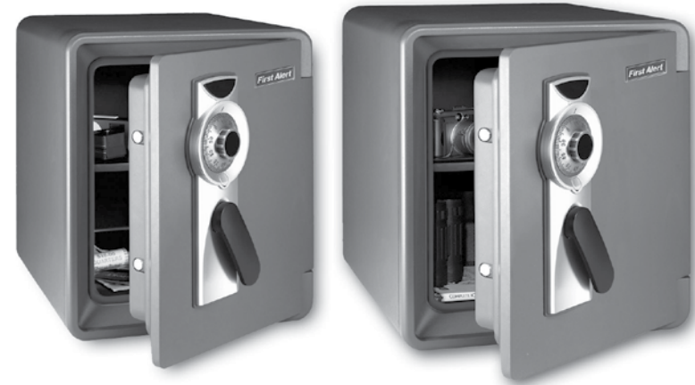
Model 2087FA & 2092FA